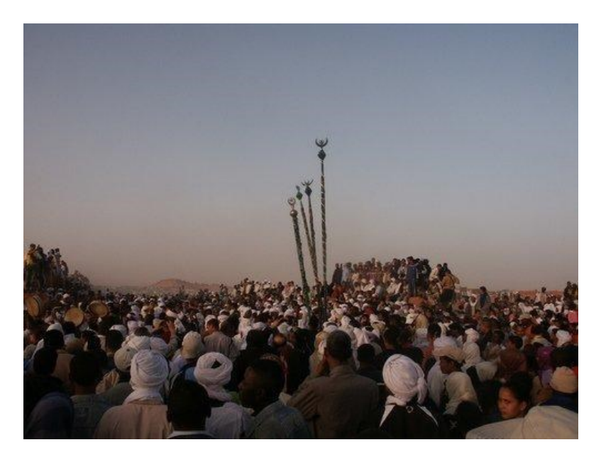
Figure 1. The Moment of Meeting

Then, all those who are present lay down with their backs against the ground as a sign of respect and devotion to the saints; thanks are given to God for their union. The rituals end with a congregational closing ceremony of high spirituality where people raise their hands high toward the sky in an atmosphere of meditation. Invocations and prayers supplicating Allah by means of His Prophet to bless the community are conducted to bring peace and prosperity and to protect believers. Pilgrims and visitors start to leave al-Hufra , wishing long lives and good things to each other until the next celebration. In a matter of minutes, the crowd spreads in all directions like impetuous water absorbed by a dry land. It is important to note that these Ziyarat (visits or pilgrimage) to saints are of great spiritual importance to the local people; however, the Salafists strongly reject them and see them as innovations which go against the true faith of Islam.